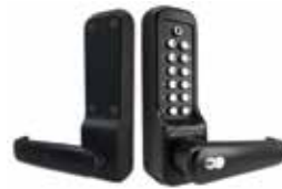
Mechanical Heavy Duty Digital Door Lock with Lever Easicode Pro Keypad and SFIC Key Override Marine Grade Black

With more models, functions & finishes to choose from with specialised adaptor plates to suit the Australian market it's no wonder Borg is the Locksmith professionals first choice for mechanical keyless locks.