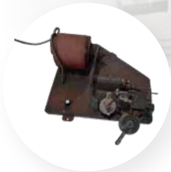
Plate machine: 1950's