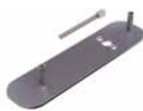
Digital Adaptor Kit 3572 suit 2000 and 4000 Series