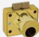
Latching Cupboard Lock (U, D, L or R) BRL78VLCAPB