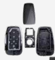
Silca Automotive Smart Key and Remote Replacement Shell for Toyota with 2 Buttons and TOY53 Emergency Blade