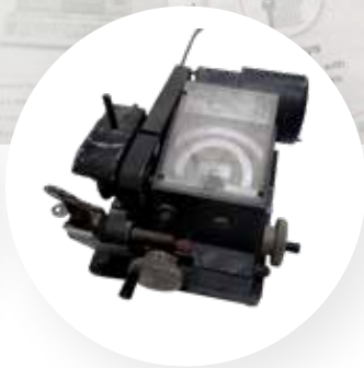
HPC 1200CM: 1970's