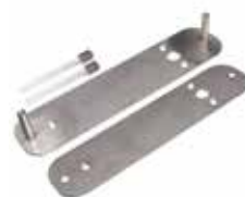
Digital Adaptor Kit 3572 suit 5000 Series BTB