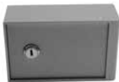
ADI Security Key Box Hinged with 22mm Cam Lock NMB1112CAM