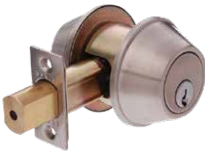
Double Cylinder Deadbolt BP210LISS