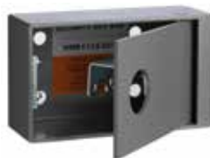
suits 003 201 cylinder ADI Security Key Box Hinge, Less Cylinder with Cam NMB1112003LC