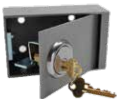
ADI Security Key Box Hinged with 201 Cylinder NMB1112201