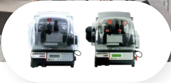
Silca Unocode 299/399: 2000's