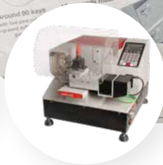
Silca Unocode Classic: 1980's