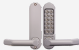
Mechanical Digital Door Lock with Lever and 8mm Spindles Satin Chrome