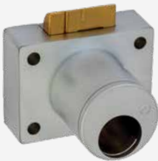
Dead-latching Cupboard Lock BR850LCASC