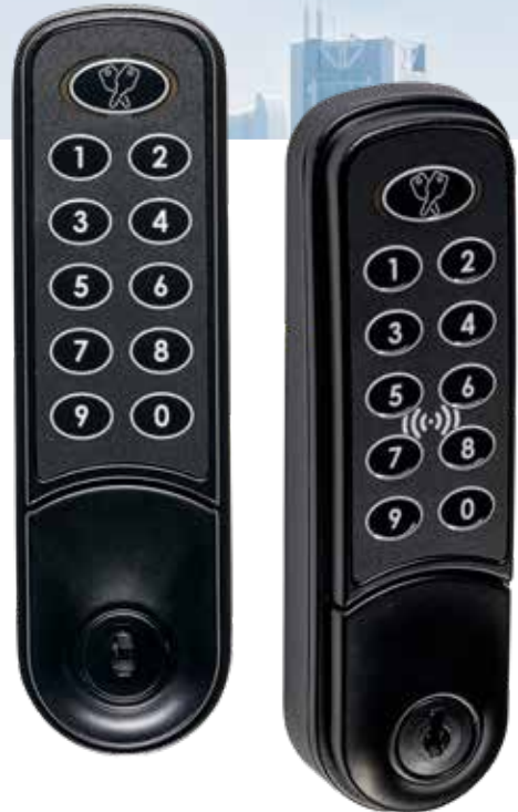
Lock Focus Nimbus 3960 Digital Cam Lock LF3960NIMBLK

Each model comes standard in Black finish, other colours and wet area option are available by special order. Cam and fixing option to be specified when ordering. Available in 20mm cam lock housing and 24mm for timber applications.