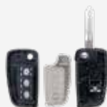
Silca Automotive Key and Remote Replacement Shell for Nissan with 3 Buttons and NSN14E Flip Blade