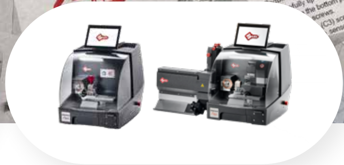
Silca Unocode F-Series: 2020's

Countless businesses in Australia build huge masterkey systems (and their businesses' success) on the back of the reliability, performance and long life of the machine.