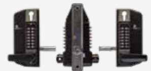
Mechanical Digital Gate Lock W/ Anti Climb Case Lever Back to Back Easicode Pro Keypads and Euro Cylinder Key Override Marine Grade