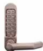
Part 5000 Series Lever Keypad Satin Stainless