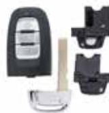
Silca Automotive Smart Key and Remote Replacement Shell for Audi with 3 Buttons and HU66C Emergency Blade