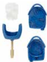
Silca Automotive Key and Remote Replacement Shell for Ford Transit with 3 Buttons and FO21 Fixed Blade