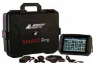
SMART PRO Programmer

SMART Pro the choice of key programming professionals.