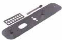
Digital Adaptor Plate BL3572KOR suit 2000 and 4000 Series