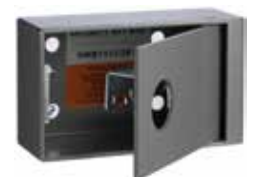
suits Abloy® Protec 201 cylinder ADI Security Key Box Hinge, Less Cylinder with Cam NMB11112EMLC