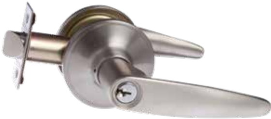
Entrance Leverset LH600B