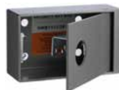
suits MT5 201 cylinder ADI Security Key Box Hinge, Less Cylinder with Cam NMB1112MT5LC