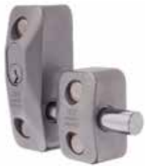
Front Mount Double Blocklok 444DDFM, SC 44142045

Be satisfied knowing that you have the strength of the legendary ADI blocklok and lock bolts taking care of your premises.