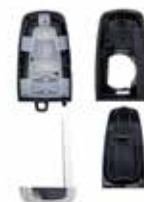
Silca Automotive Smart Key and Remote Replacement Shell for Ford with 3 Buttons and HU101E Emergency Blade