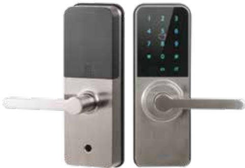
Dahua Bluetooth Smart Lock, Silver Finish DHASL2101S