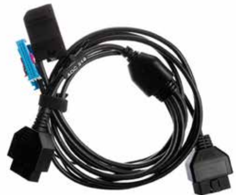
VAG Instrument Cluster Reset ADC219

Please refer to the SMART Pro Development notes in LSC CarLab, the menu in an up to date SMART Pro tool or MYKEYSPRO for a comprehensive and most importantly an accurate Applications List.