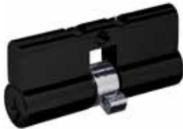
9555-3 Double Cylinder, Lazy Cam BRM905553MB