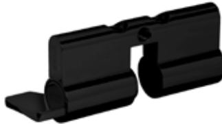
9555-4 Single Cylinder, Turn Lazy BRM905554NBMB