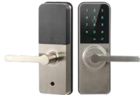
Dahua Bluetooth Smart Lock, Black Finish DHASL2101B