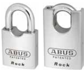
ABUS 83/55 SERIES SECURITY LEVEL 3 (SL3)