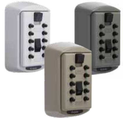
KIDDE Keysafe S6, 2 Key Capacity 001370 White SU1370 001371 Clay SU1371 001193 Titanium SU1193