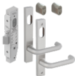
DKSB2212KIT1 SB2212 Double Cylinder Lock Kit