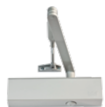
DOTS7300SIL TS73 EN1-4 Closer

*For a list of terms and conditions go to https://www.lsc.com.au/page/Terms__Conditions/