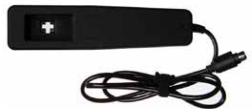
SMART Aerial ADC242

Pleasingly, these VW Group updates have been developed by an Advanced Diagnostics engineer here in Australia working closely with LSC.