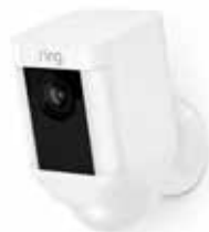
Ring Spotlight Camera

Protect every corner of your home with Spotlight Cam Battery, a versatile wire-free HD security camera.