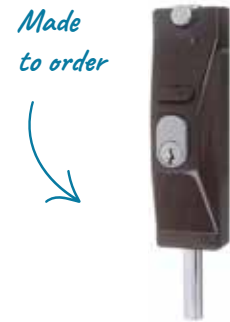
ADI Lock Bolt 5004 FB 44142003