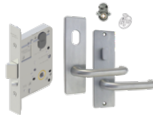
KIT3 Entrance Lock Kit 600 Series