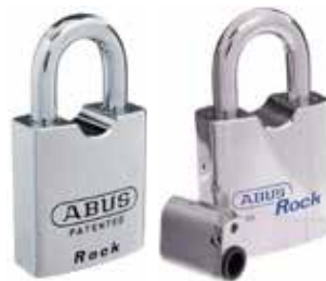
ABUS 83/60 SERIES SECURITY LEVEL 3 (SL3)