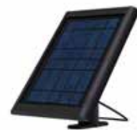
Ring Solar Panel suit Spotlight Camera Battery

With just a few hours of direct sunlight every day, your Spotlight camera will stay charged around the clock.