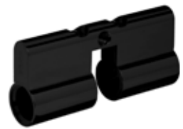
9555-3 Double Cylinder, Lazy Cam BRM905553NBMB