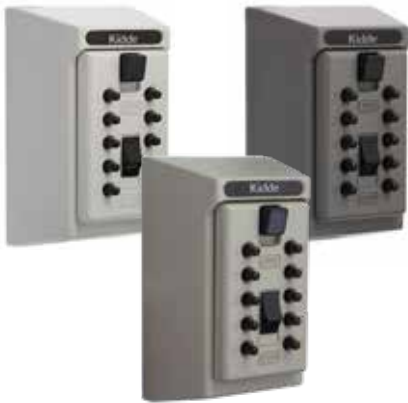
KIDDE Keysafe S5, 5 Key Capacity 001360 White SU1360 001361 Clay SU1361 001361 Titanium SU1365

BUY 1 BOX = LESS 7.5% BUY 2 OR MORE BOXES = LESS 15%