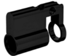
9555-4 1/2 Euro Fixed Cam BRM905555NBMB