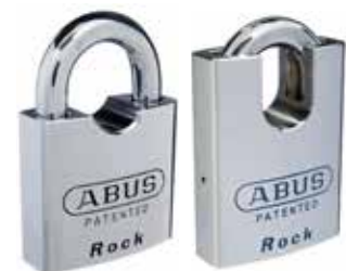
ABUS 83/80 SERIES SECURITY LEVEL 4 (SL4)

Must have SCEC approved keying system installed and be key retained. When a keying system with a lower SL rating is used, the padlock inherits the lower SL rating.