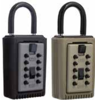
KIDDE Keysafe C3, 3 Key Capacity 001350 Clay Padlock SU1350 001192 Titanium Padlock SU1192