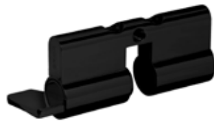
9555-2 Single Cylinder, Turn Fixed BRM905552NBMB