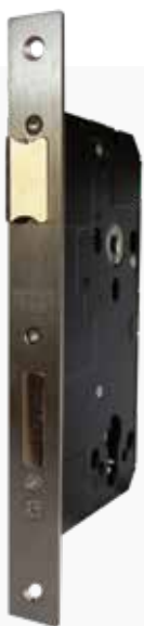
PROTECTOR Heavy Duty Euro Style Sash Lock with 60mm Backset SS PR78560SS