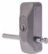
ADI BLOCKLOK 444 Single, Satin Chrome 44142030