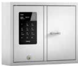
Creone KeyBox System 9001S B/Backup Audit Trail CR1413011

Total peace of mind at all times when you store your belongings or valuable equipment when connected to Creone's KeyWin6 web-based administration system; gives the right person secure storage of their belongings at all times, with the help of a laptop or tablet.