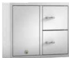
Creone KeyBox 9002E Expansion Cabinet 16 Key Gap 2 Door CR141312