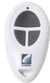
Gliderol Garage Door Remote with 3 Buttons - TM390 RCG40 RH4002