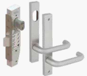
SB2212 Classroom Lock Kit DKSB2212KIT6

*For a full list of terms and conditions go to lsc.com.au/ride-the-tide-with-dormakaba