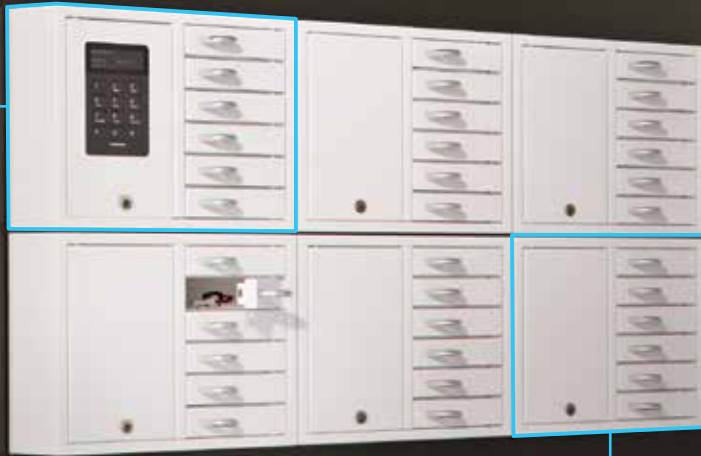
Creone KeyBox System 9006S B/Backup Audit Trail CR1413211