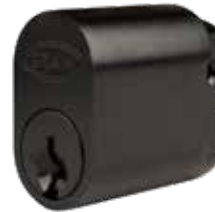
BRAVA Metro Oval Cylinder 5070XBLKDD