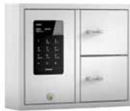
Creone KeyBox System 9002S B/Backup Audit Trail CR1413111