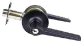
BRAVA Urban Entrance Leverset LEX900B