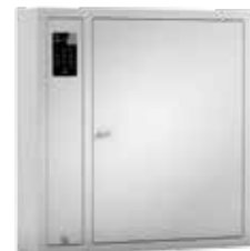
Creone KeyBox System 9500S B/Backup Audit Trail CR1413411