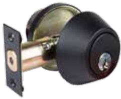
BRAVA Urban Double Cylinder Deadbolt D3X92B

Matt Black is now the third most popular finish on the market, behind Satin Chrome and Stainless Steel