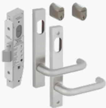
SB2212 Double Cylinder Lock Kit DKSB2212KIT1