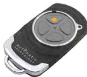
ATA Triocode Garage Door Remote with 4 Buttons - PTX6 61228 RH2006