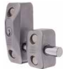
ADI BLOCKLOK 444DDFM Double Front Mount, Satin Chrome 44142045