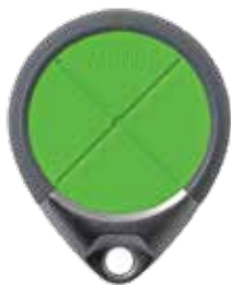
Merlin Garage Door Remote with 4 Buttons - E970M RH1080

Check out our range in branch, online, or ask your Account Manager.