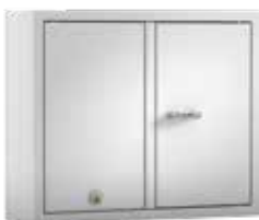
Creone KeyBox 9001E Expansion Cabinet 29 Keys CR141302