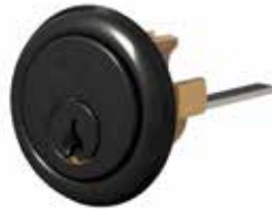
BRAVA Cylinder Rim 2001 (Boxed) BRU20016BLKDD