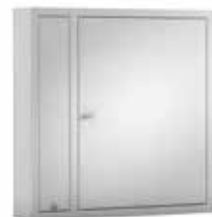
CREONE Keybox 9500E Expansion Cabinet CR141333