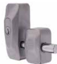
ADI BLOCKLOK 444DD Double, Satin Chrome 44142040