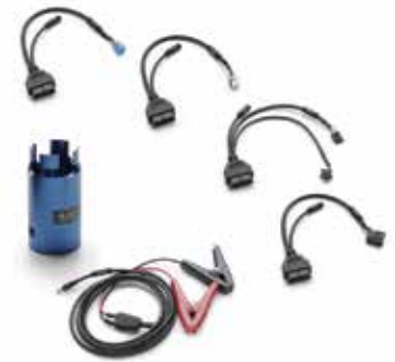
AD SMART Pro Mercedes All Keys Lost Cable Kit ADC2600 SD756298AD