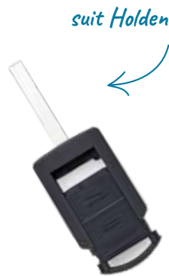
Silca Remote Auto 3 Button with Flip Blade HU66 & HU162 ID88 SHUAR22