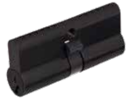
BRAVA Urban Double Euro Cylinder 31705PHEBLK