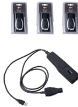
AD SMART Pro Mercedes Kit (including Programmer + 3 Keys) SD755333ZB